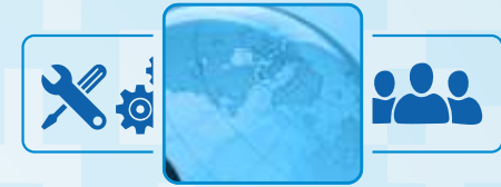
Truly Global Case Management System