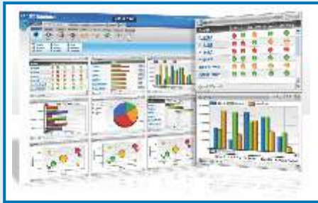
Directors and Program Managers Dashboard & MI