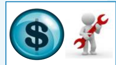
Well priced & Supported