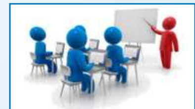
Easy to learn and train