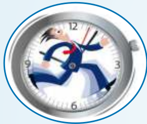
Time bound case resolution