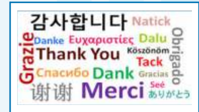
Support Multi Language